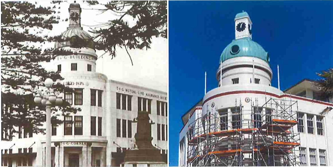
Then and now – the restoration of the T&G Building dome and clock