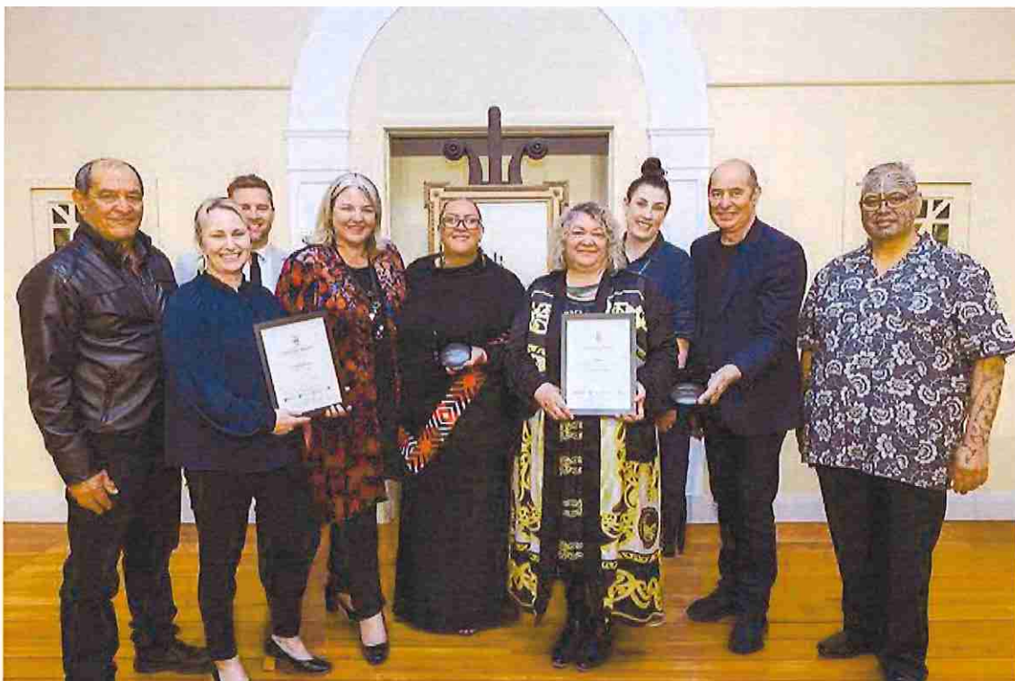
Members of the Ngā Ara Tipuna, Waipukurau-Takapau project team

Launching our 2023 Art Deco Festival Napier programme in October 2022, we eagerly anticipated a balmy Hawke's Bay Summer and a return to business as usual!